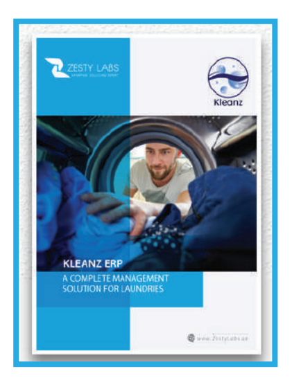
Kleanz - Laundry ERP & Mobile APP