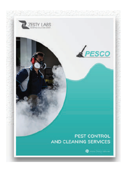
Pesco - Pest Control Services ERP