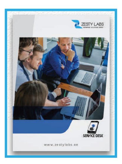
Service Desk - Service and help desk ERP