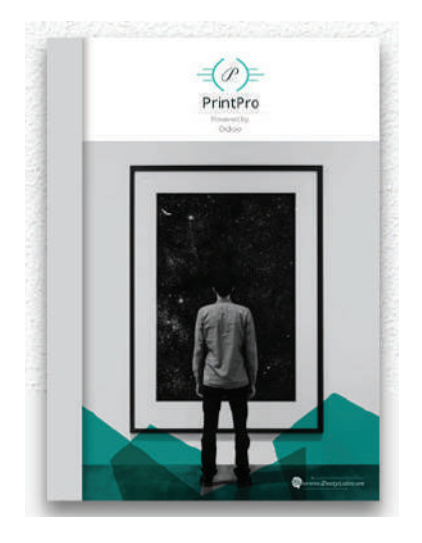
Print Pro - ERP for Printing and Ad Agency