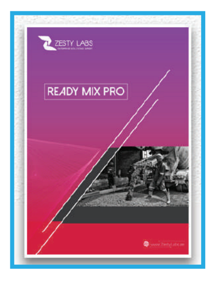
Ready Mix Pro - Concrete ready mix ERP