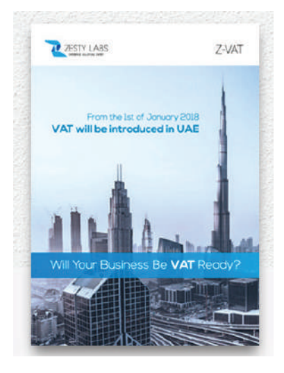
ZVat - VAT Solution for UAE