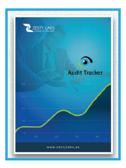
Audit Tracker - Accounts & Audit Management ERP